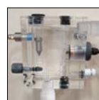
Free amperometric probe