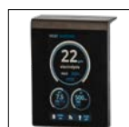
Detachable touch screen