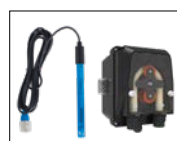
pH kit as standard