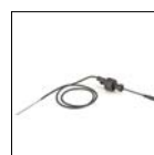
Flow switch included