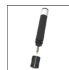
Free chlorine membrane probe