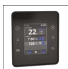
Detachable TFT screen