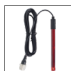
Redox probe kit as standard